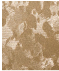
Café Au Lait